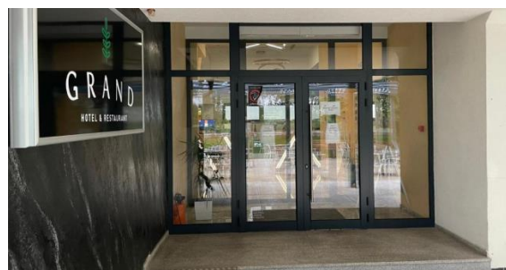
Grand Hotel&Restaurant, Obrovacki put bb, 21400 Backa Palanka

NOTE: The Directorate for inland waterways (Plovput) provides transportation from Belgrade to Bačka Palanka for all those arriving by plane. If you need this type of service please contact: