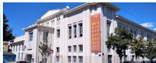
Museum of Science and Technology Skenderbegova 51, Belgrade