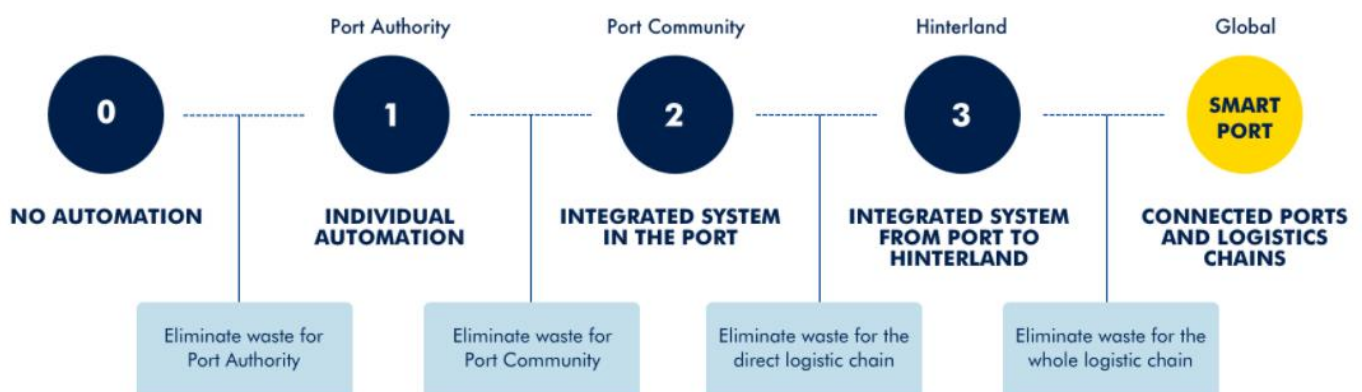
Figure 1: Digital & automation maturity levels

One of the first steps in the digitalization journey of ports is to determine the digitization and digitalisation level of the port's current activities/processes. Based on existing good practices, the digitalisation of ports is handled in a 5 step-approach. Level zero considers no digitization, all information is available and is being handled in analogue format. The starting point is digitalisation level 1 (which considers that information is available in digital format), and is represented by the port authority as a closed system, followed by level 2 port community (digital interaction is enabled between all stakeholders in the port) and then moving one step higher by bringing the hinterland into the process of digital interaction (level 3) . The last step ( level 4 ) is to connect smart ports all over the world to each other (forming one single world-wide port community). 2