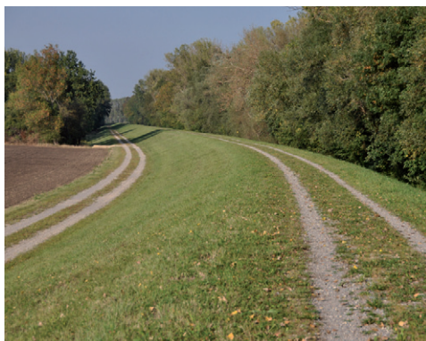
Continuous advancements in safe, modern flood protection.

viadonau actively supports water authorities and flood associations in the protection of local communities, buildings and equipment on the Danube, March and Thaya from the effects of flooding. This is achieved through comprehensive preventive measures and competent deployment management in cases of floods and other emergencies. viadonau's extensive know-how concerning the construction, maintenance and operation of environmentally friendly flood-prevention systems is regarded as a model throughout Europe.