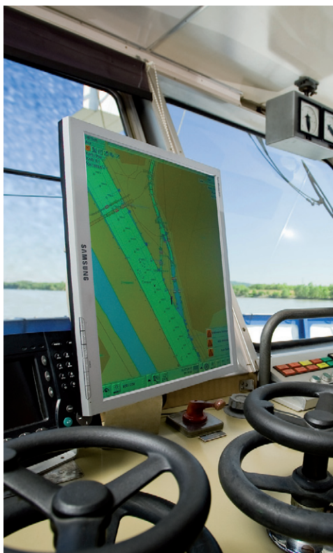
The most modern communication technologies to ensure the safe flow of traffic.